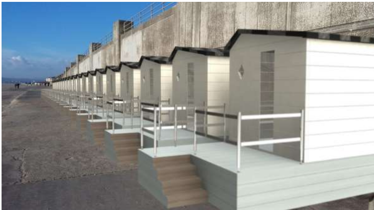
Proposed new beach huts at Bönningstedt Parade