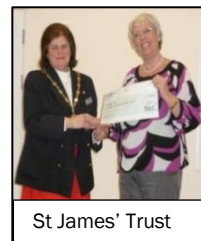
St James' Trust

The Seaford Downs Syndrome and Special Needs Support Group will receive their £1,791 cheque at a later date as they were unable to attend on the evening.